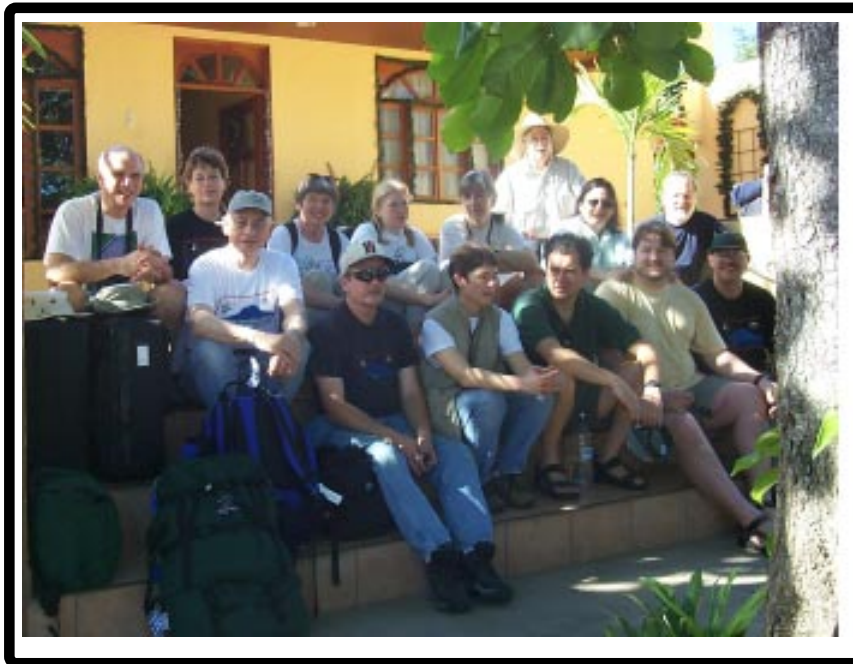
Coffee Delegation assembles in Managua