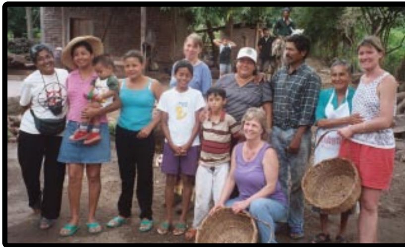
Farmer delegation meets producer family.