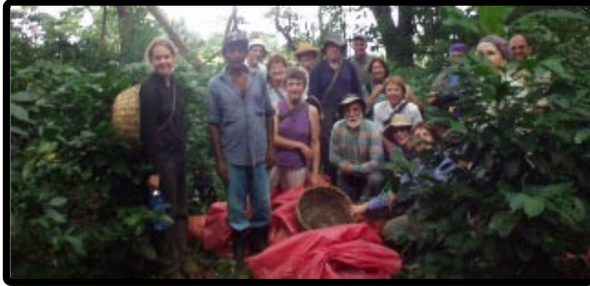
December 2003 coffee delegation with some of their harvest.

Ometepe is a Nahuatl word meaning “two hills”...Riding in the back of trucks from pueblo to pueblo, one has to hold on for dear life because you just never know when the wheels will find another pothole (and they do very often!)...I noticed how clean it was around individual homes, and then realized that each day, the dirt around each house is raked and the debris burned. Somehow, I sensed a sort of peace in caring for one’s place. And when I saw these cared-for homes, I felt a sense of peace myself.