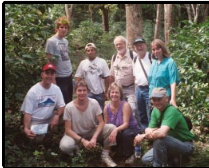
Bainbridge farmers in coffee forest.

Language was sometimes a challenge, but photos of Bainbridge farm animals, vegetable gardens and compost piles proved to be fertile fodder for many conversations between the farmers of the two islands! While the farmers from the North got a window on agriculture in the developing world, they also shared stories of their own efforts with small scale organic farming. As always, we expect that the seeds sown through these new friendships will grow over time and blossom into a mutual understanding of the basic struggles and successes of those who produce the foods we all enjoy.