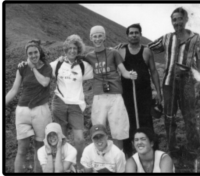
A hike up Volcan Concepcion, the active volcano on Ometepe

relationships, so much enriching growth and, often a profoundly life-changing