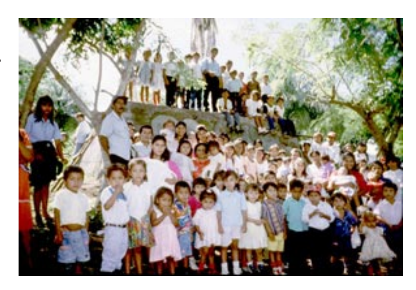
Inaugurating a new water system

This successful example of working cooperatively as a community was a great inspiration to neighboring Tichenas and Balgüe. By now