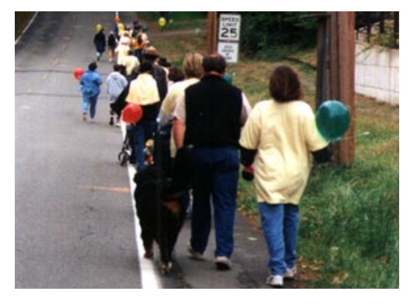
BIEA walks for Ometepe Scholarships

This is a great start on fund-raising for a new scholarship or a solid addition to the existing scholarship account. A very warm thank you to all who participated.