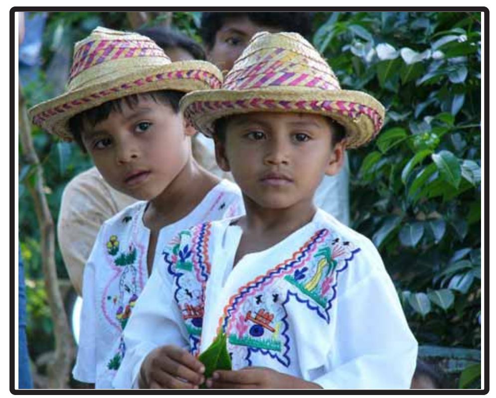
Two young folkdancers , Ometepe, Nicaragua.