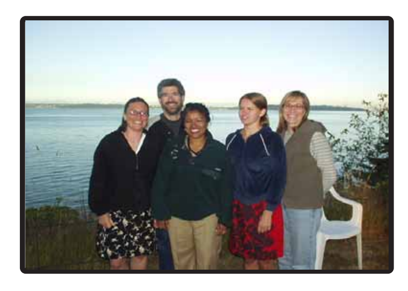
Former & current office staff

One of the most outstanding things was the acquisition of two scholarships for the new secondary schools of Merida and San Jose del Sur. The association and the scholarship committee