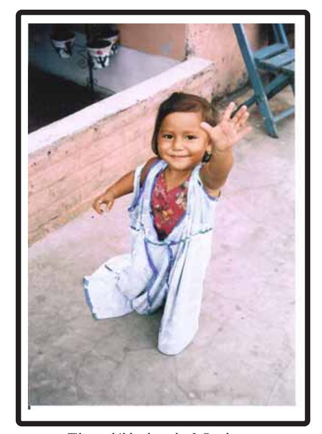
Tilgüe child