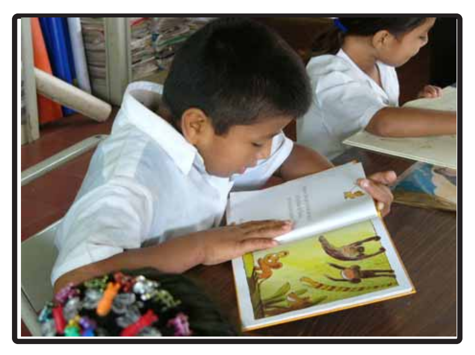
Enjoying donated storybook

2004 witnessed a record number of memberships—117. As well, One Call for All, the Bainbridge Foundation's annual fund drive, added 100 more contributors. Many others have volunteered their time, bought Café Oro coffee, and supported the good works of the Sisters Islands Association. It is not necessary to pay a membership fee to participate in activities of the Association, but memberships help pay for the mailings you receive.