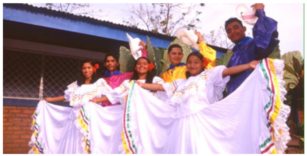
Saturday, October 6th --our FIFTEENTH Anniversary Fiesta!

(see related article on page 4. Full details in the Fall issue)