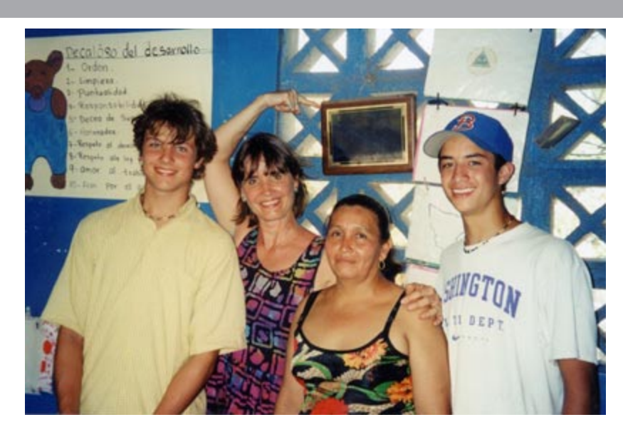
After 7 long years, visiting the Los Ramos Preschool.