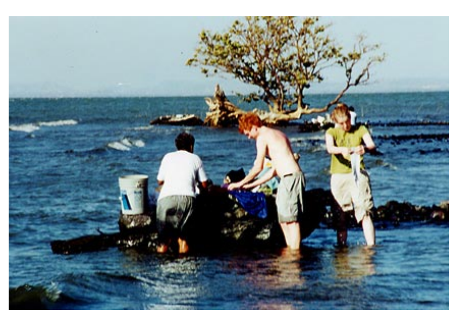
Learning to wash clothes in Lake Nicaragua

Our student delegations fulfill the goals of BOSIA to create people-to-people relationships and a cultural