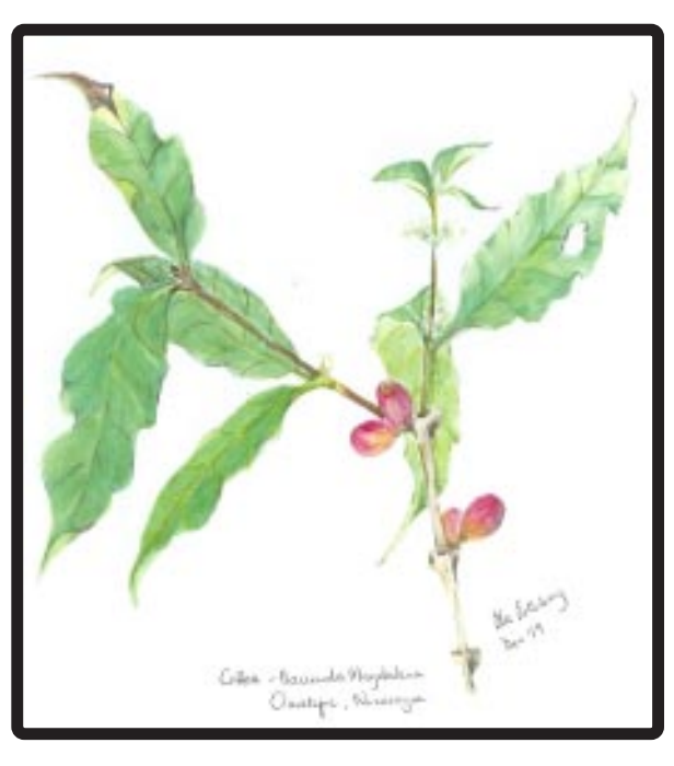
Botanical illustration--coffee plant by Ela Esterberg

As the delegation's interpreter I was carefully translating this discussion. I've learned that effective interpretation offers a transparent vehicle for communication. Even so, the process of translation often reveals its own story. The Bainbridge delegates were eager to learn about the cooperative's profits.